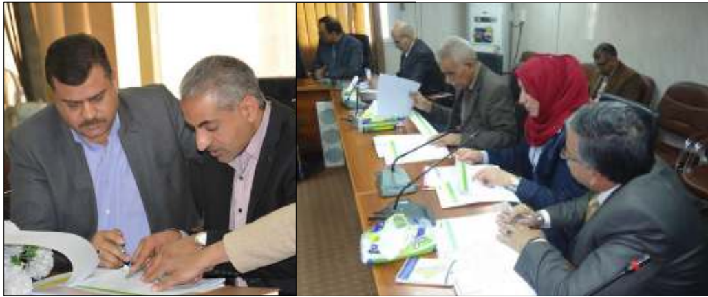
MMPW committees reviewing DMAT results with provincial subcommittees.

On February 8th, the Ministry of Municipalities and Public Works' (MMPW) Urban Planning and Sewage Committees met with provincial subcommittee counterparts from Najaf, Karbala, Muthanna, Diwaniyah, and Anbar to review results of the Decentralization Mapping and Analysis Tool (DMAT) developed by targeted provinces and with assistance from GSP/Taqadum. The Directorate General of Urban Planning agreed to transfer administrative, legal, and finance functions to the provinces, but participants agreed to keep technical functions—establishment and oversight of national urban planning standards—at the ministerial level.