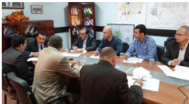
Kirkuk GO officials discussed the GO and FAD proposed structures with project staff.

As a follow-up to the recommendations made at the financial workshop, project financial specialists discussed job description and staffing resources for the proposed provincial Financial Affairs Department with Diyala and Wasit Treasury managers. As a result, proposed job descriptions were developed for the main staff in the proposed FAD sections and units. Further, GSP/Taqadum discussed and made final revisions to a proposed organizational structure for the GO and provincial FAD with Kirkuk key GO officials. In Baghdad, the GO organizational structure was discussed with the Deputy Governor and GO section managers. Participants provided feedback and suggested some revisions to the proposed structure.